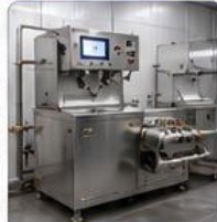
ICE CREAM FREEZER