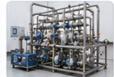
INSTALLATION & PIPING