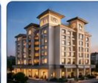
HOTELS & HOSPITALITY