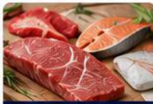
MEAT, FISH & SEAFOOD