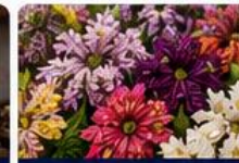
HERBS & FLOWERS