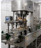
FILLING & PACKING MACHINE