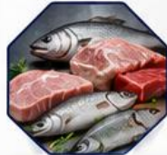
FISH & MEAT