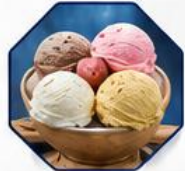
ICE CREAM & FROZEN FOODS