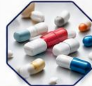
PHARMACEUTICALS & HEALTHCARE