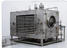
VACUUM FREEZE DRYER