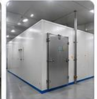
COLD STORAGE ROOM