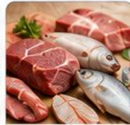
MEAT, FISH & SEAFOOD