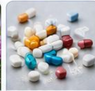
PHARMA & HEALTHCARE