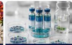
BIOTECH & CULTURES