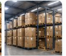
FOOD & BEVERAGE INDUSTRY