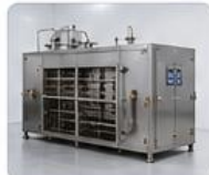
PRE FREEZING SYSTEM