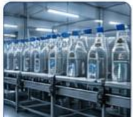
FOOD & BEVERAGE INDUSTRY