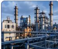
PLASTIC & RUBBER INDUSTRY