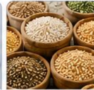
AGRI & SEED STORAGE