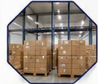
FOOD PROCESSING INDUSTRIES