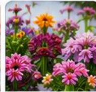
FLOWERS & NURSERY