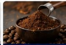
COFFEE & BEVERAGES